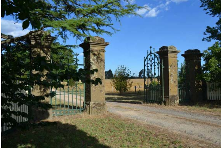
Photo 1 Gate posts and cast iron gates