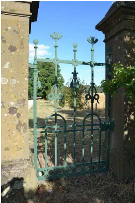
Photo 2 Detail of pedestrian gate