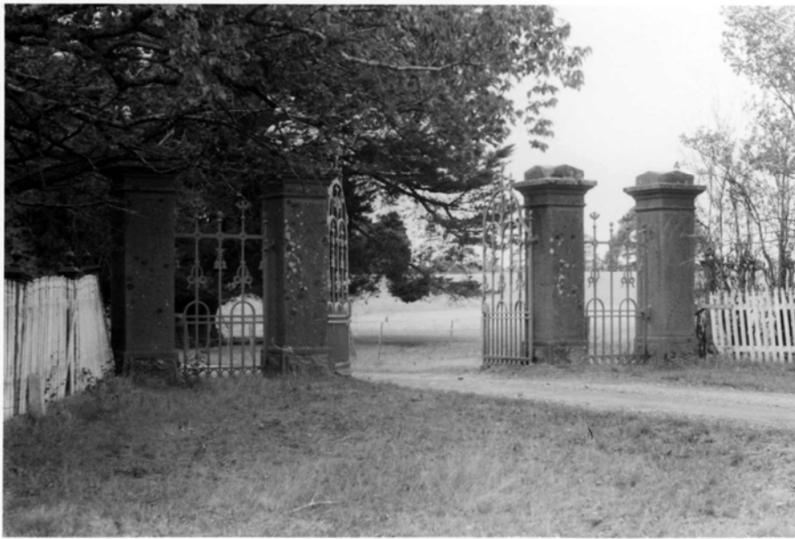
Illustration 2 State Library of Victoria, John T Collins Collection, 9 April 1983. Showing gates and picket fences prior to reconstruction.