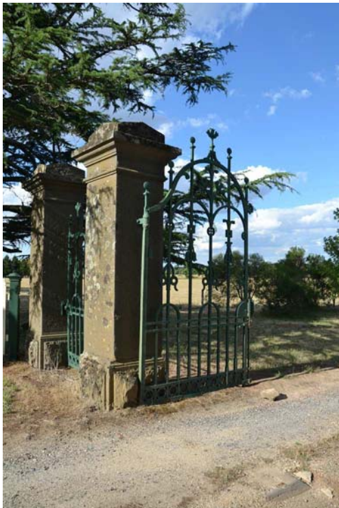
Photo 5 Pillar showing slight damage and rotation.