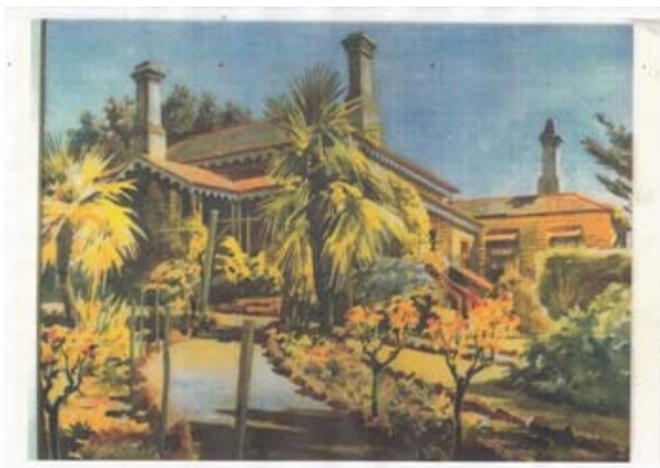
Illustration 1 Copy of painting of house prior to fire.