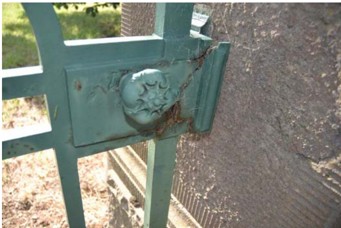
Photo 3 Detail of lock and cast iron handle