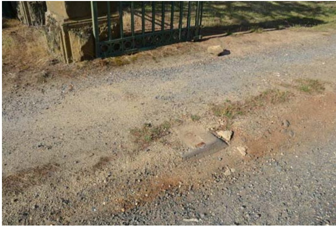
Photo 4 Detail of central stone slab for fastening gates