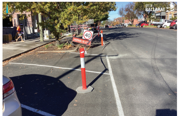
Figure 4 - Signage non-compliant with Code of Practice for Worksite Safety – Traffic Management

If Traffic Management Plans are proposed traffic control devices (beyond basic works advisory signs that certain utilities may use under conditions), authorisation under the Road Safety (Traffic Management) Regulations 2019 is required and commonly referred to as a Memorandum of Authorisation (MoA) . Traffic control signs/signals must be authorised, and Traffic Management Plans must meet the Code of Practice for Worksite Safety – Traffic Management.