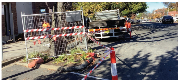
Figure 5 - Tree Protection Zone does not meet AS 4970-2009 and City of Ballarat Guidelines

Only authorised personnel may prune or remove public trees.