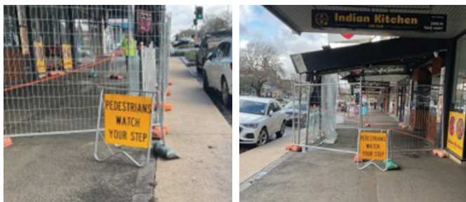
Figure 3 - Pedestrian path is non-compliant as it does not meet minimum 1.5m clear width

During footpath occupation, a clear path width of 1.5 metres shall be provided for all pedestrian traffic to walk without walking onto the road carriageway. The pedestrian route shall have a firm, even and free draining surface, free from steps and obstructions. The route for pedestrian traffic shall be clear of nature strip trees, signposts or other similar obstructions.