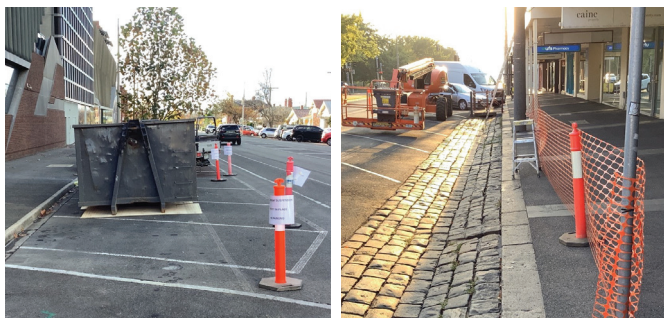
Figure 1 - Examples of road occupation

The permit ensures these assets remain safe and serviceable throughout construction and are not left damaged once works are complete.