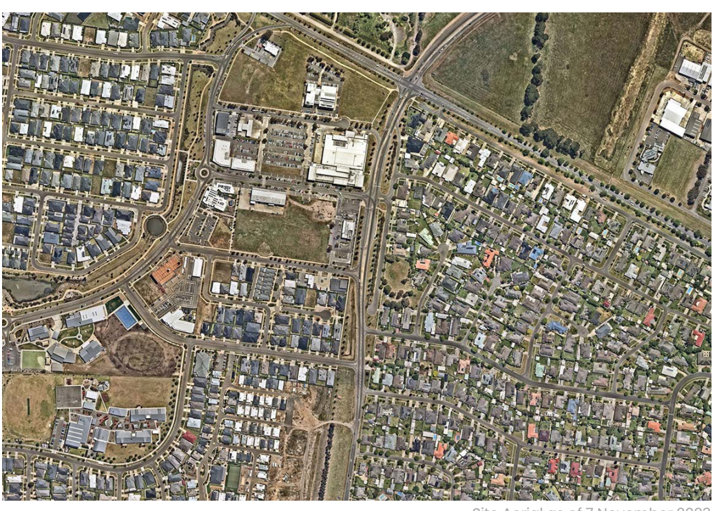
Site Aerial as of 7 November 202

Average daily traffic on Dyson Drive increased from 6,529 in 2016 in 10,490 in 2021.