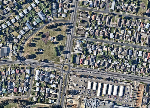
Site Aerial as of 3 November 2023

Wendouree Library and Learning Centre continues on next page