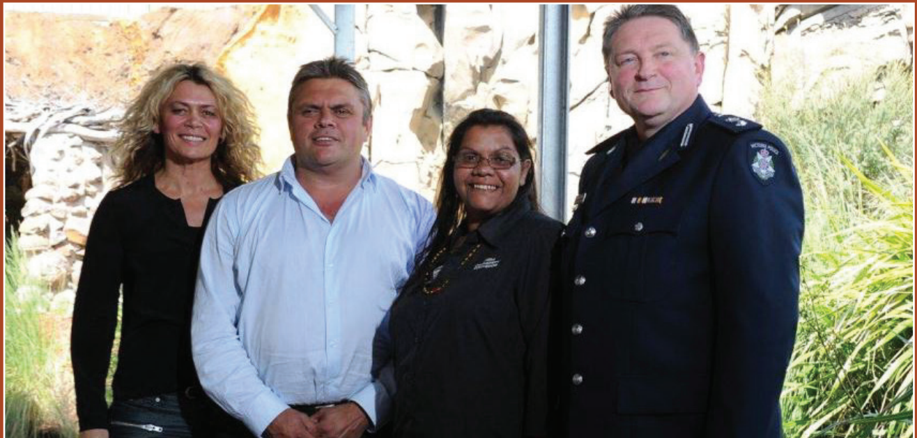
Launch of the Koori Family Violence Police Protocols in Ballarat