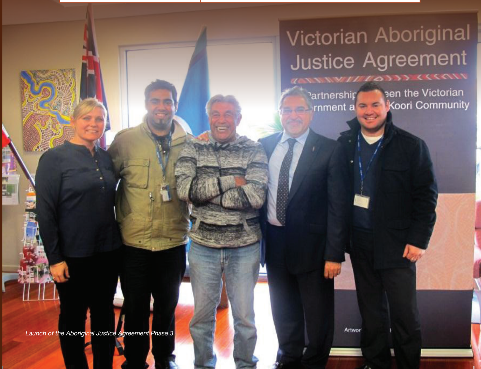
Launch of the Aboriginal Justice Agreement Phase 3