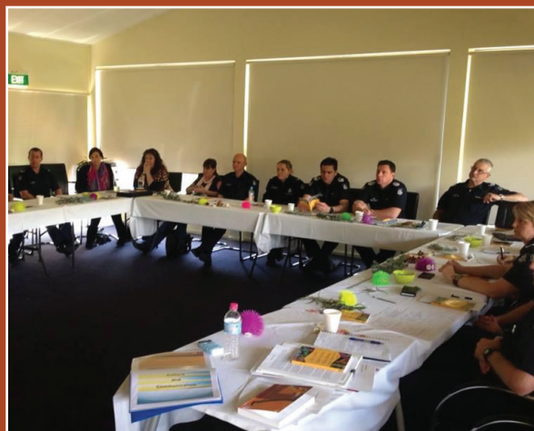
Victoria Police and Wisc members undertaking Koori Cultural Awareness Training