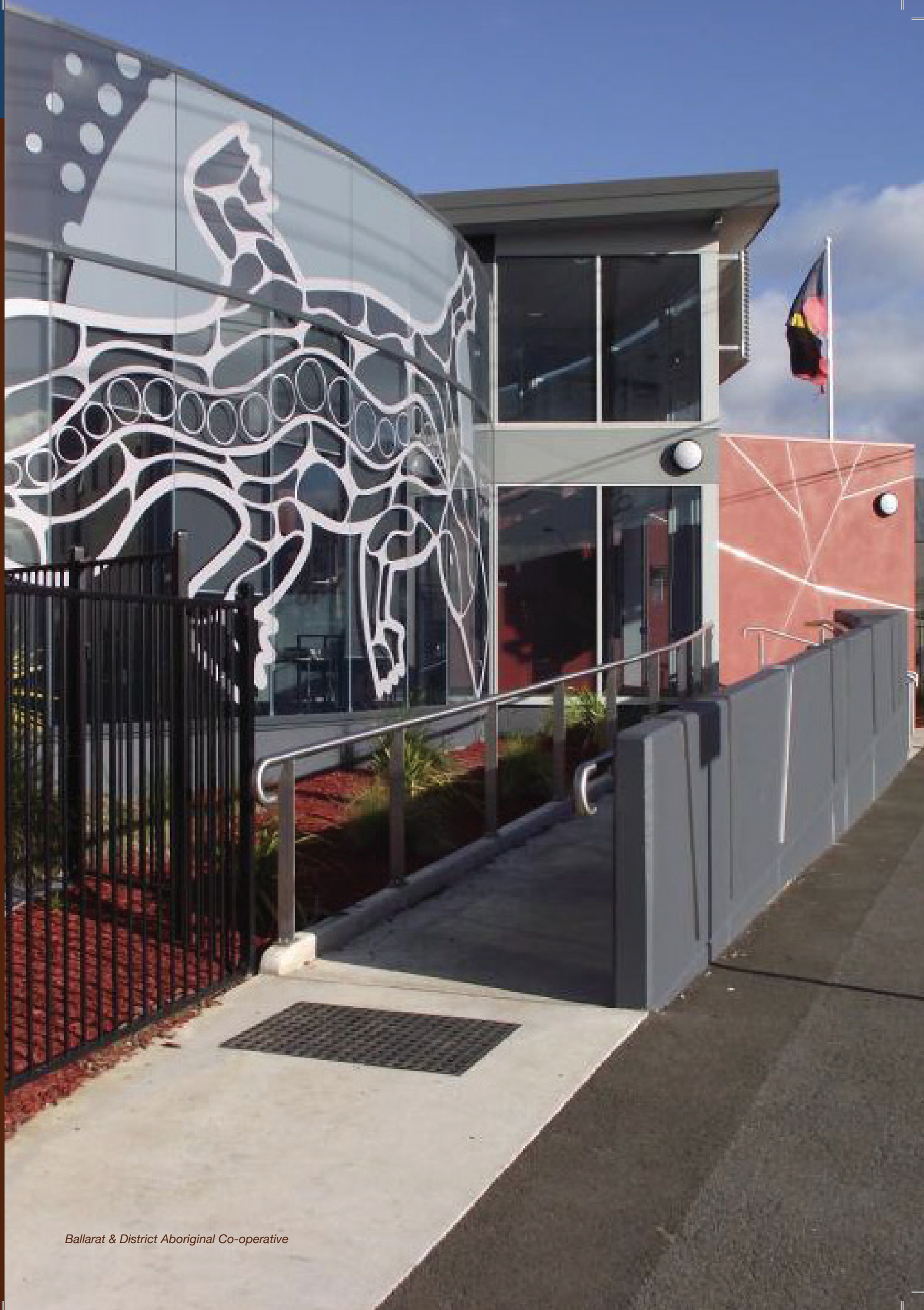
Ballarat & District Aboriginal Co-operative