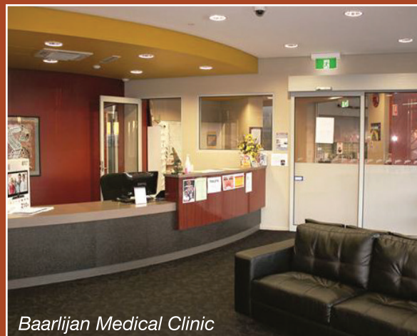
Baarlijan Medical Clinic