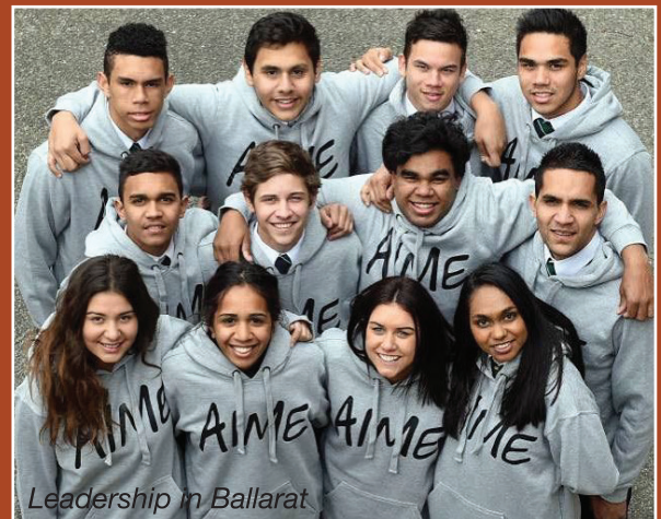
Leadership in Ballarat