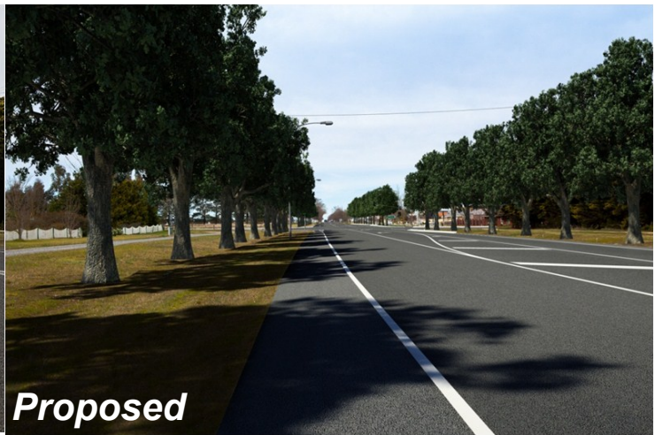
Pictured above: Remembrance Drive/Sturt Street intersection (East Bound)