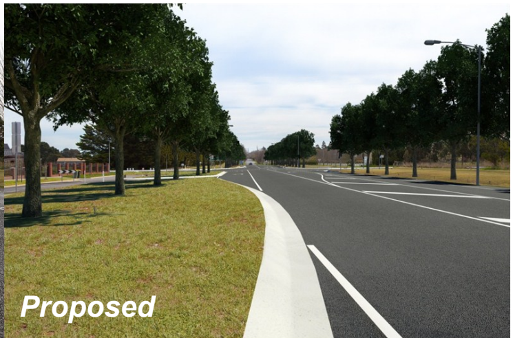
Pictured above: Remembrance Drive/Sturt Street intersection (West Bound)

TIMEFRAME: Expected completion by April 2015.